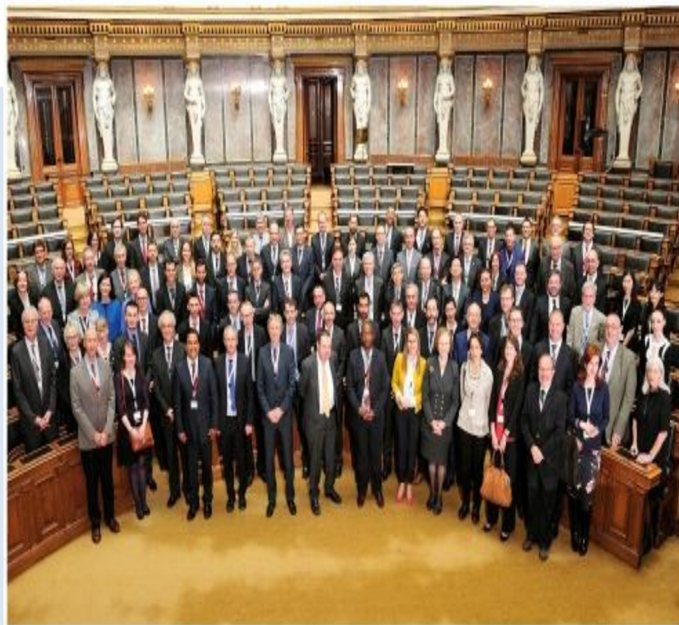
7 th Annual OECD PBO Network Meeting Vienna, 16-17 April 2015

Agendas and documents for PBO meetings are available at: www.oecd.org/gov/budget/pbo